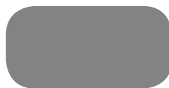
SLATE GRAY★ SR .37 SRI 41