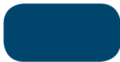
GALLERY BLUE★ SR .28 SRI 30