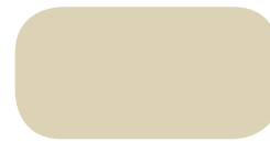
LIGHT STONE★ SR .50 SRI 58