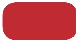
BRITE RED SR .49 SRI 55