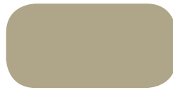
DESERT SAND★ SR .42 SRI 48