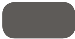
CHARCOAL GRAY★ SR .28 SRI 30