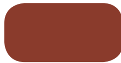
RUSTIC RED★ SR .36 SRI 40