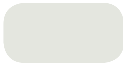
POLAR WHITE★ SR .58 SRI 69